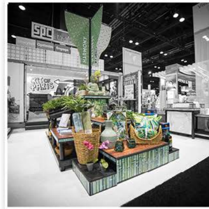
Focal Cluster PAGE 14