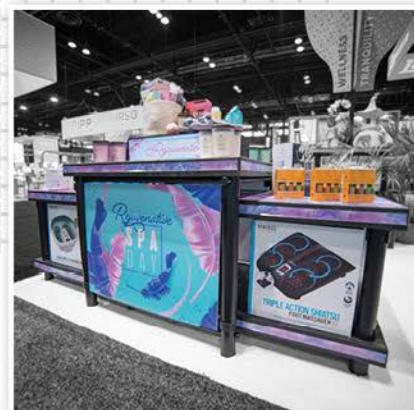
Nesting Tables PAGE 12