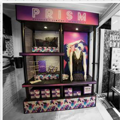
Wall Decor PAGE 10

From our Design Lab desk to yours, this look book includes our collection of displays featured at the 2019 GlobalShop Show at RetailX. From retail fashion to general merchandise to health and beauty, we have carefully curated ideas for a variety of unique spaces that will help you kick-start your next project.