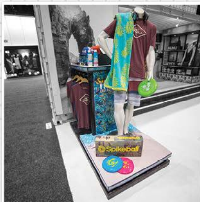
Apparel Rack PAGE 11