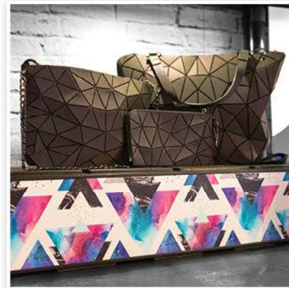
Add-On Accessories PAGE 17