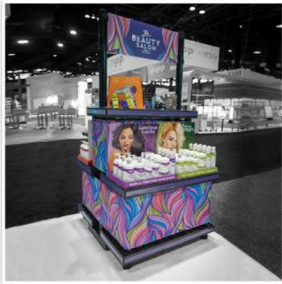
3-Step Pyramid PAGE 13