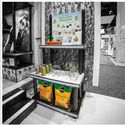
2-Step PAGE 16